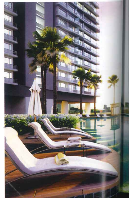
Below: Its landscape and innovative architectural designs are set to sustain an eco-friendly environment.